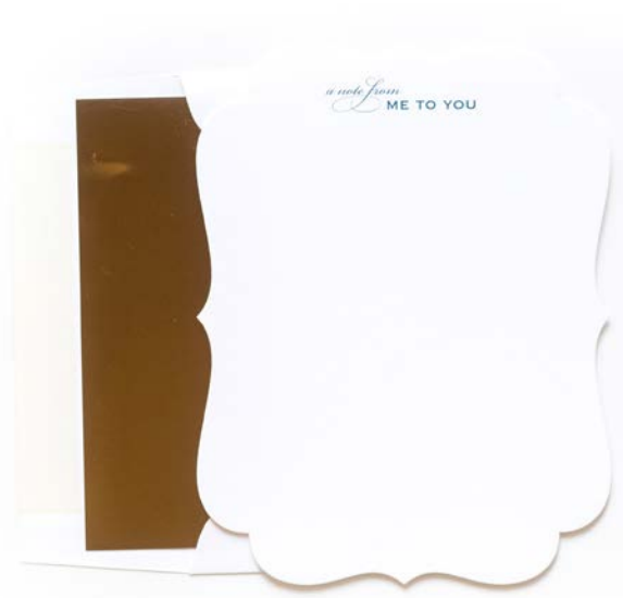
TYP05 a note from me to you // die cut