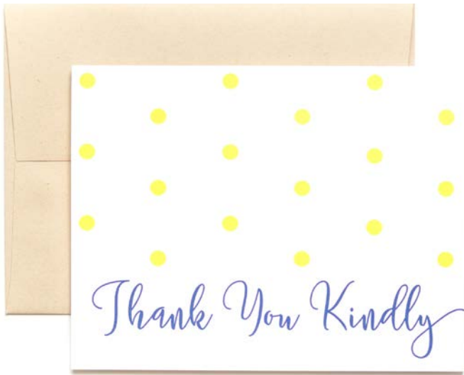
DOT01 thank you kindly