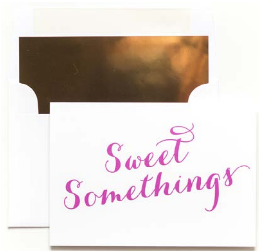
CAR01 sweet somethings