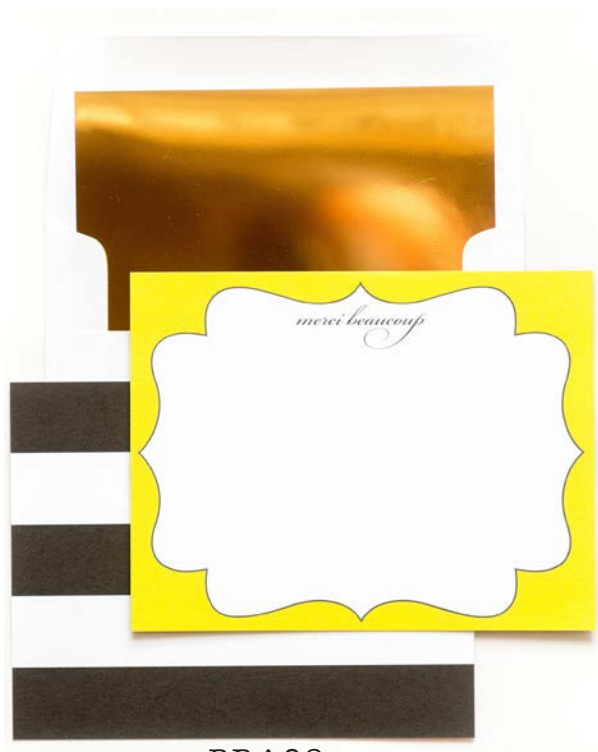
BRA02 merci beaucoup

Mirror, Mirror... this liner is the fairest one of all