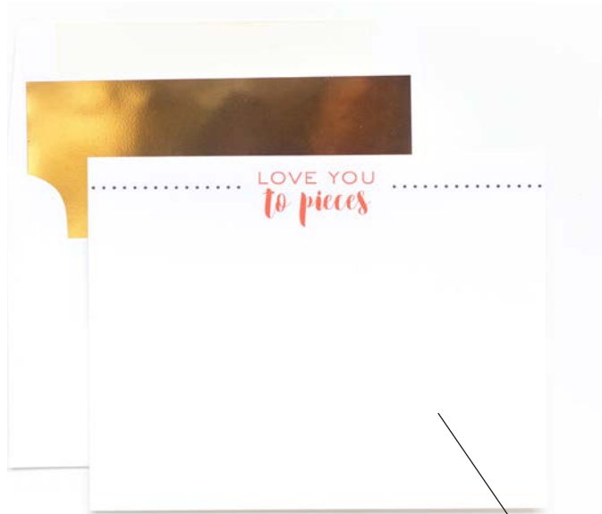
TYP01 love you to pieces