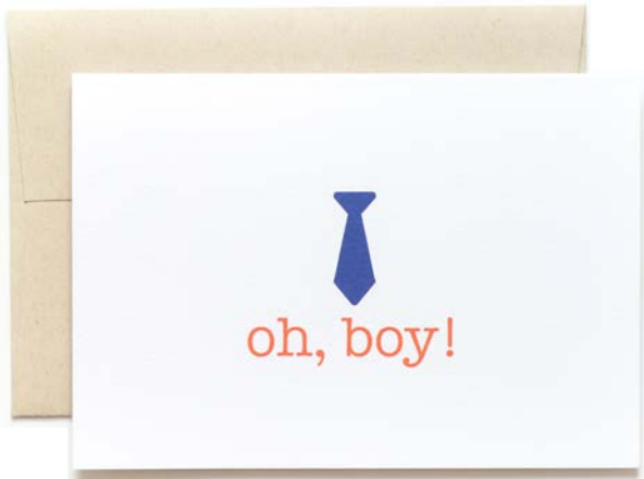
BOY03 oh, boy! 3.5 x 5 folded card

set of 6 cards // see corresponding sizing paper bag envelopes (unlined) // minimum of 6 per style