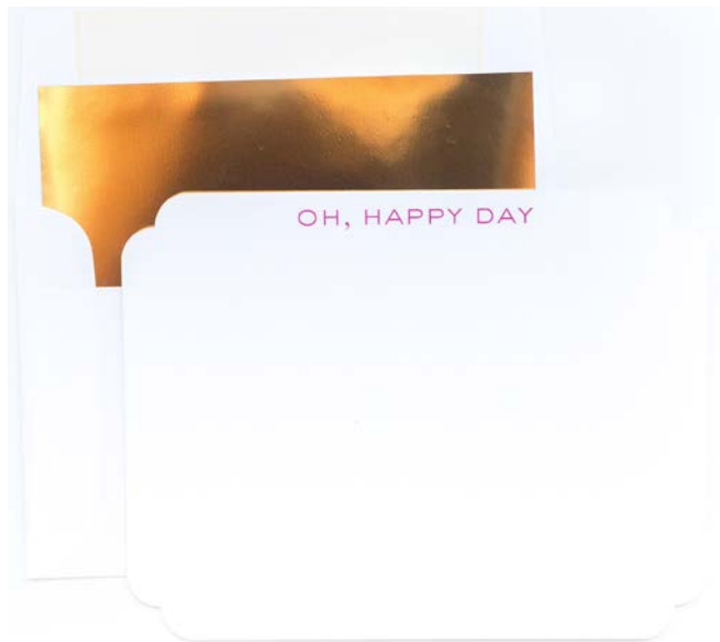
TYP03 oh, happy day // die cut