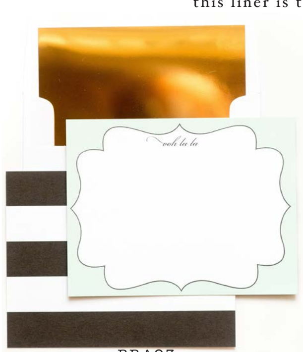
BRA03 ooh la la

Mirror, Mirror... this liner is the fairest one of all