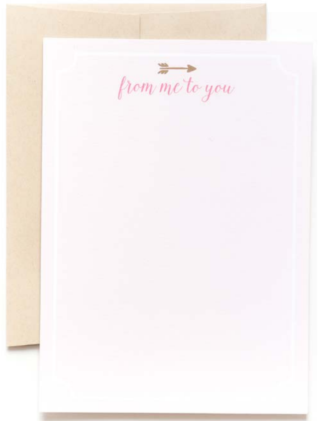
GIRLO2 from me to you 4.5 x 6.25 flat card