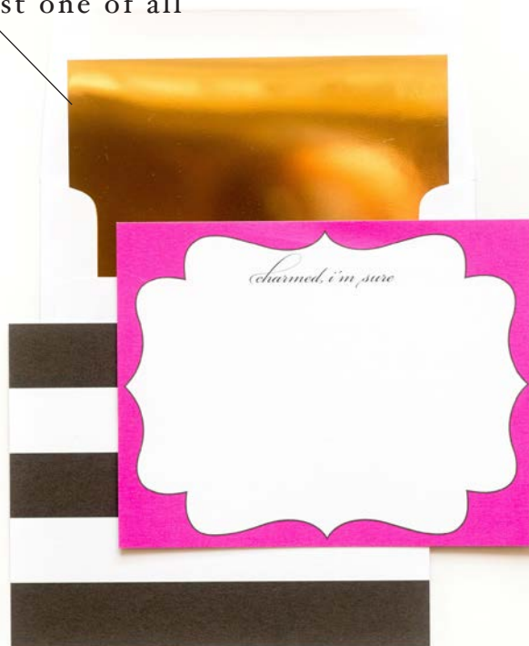
BRA04 charmed, i'm sure

set of 6 or single cards // 4.25 x 5.5 flat cards gold mirror-lined white envelopes // minimum of 6 per style or set