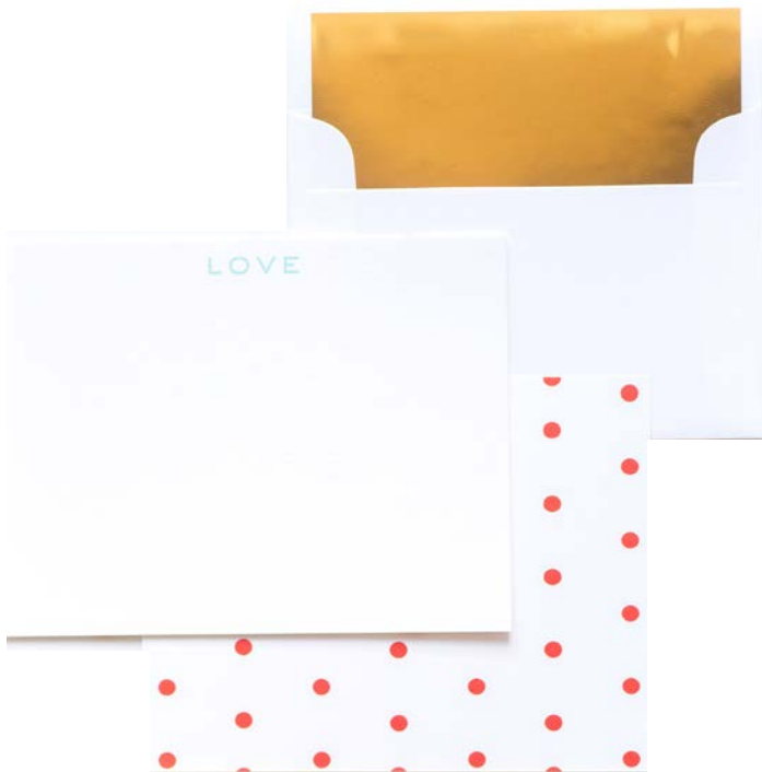
TYP07 love // red polka dot back