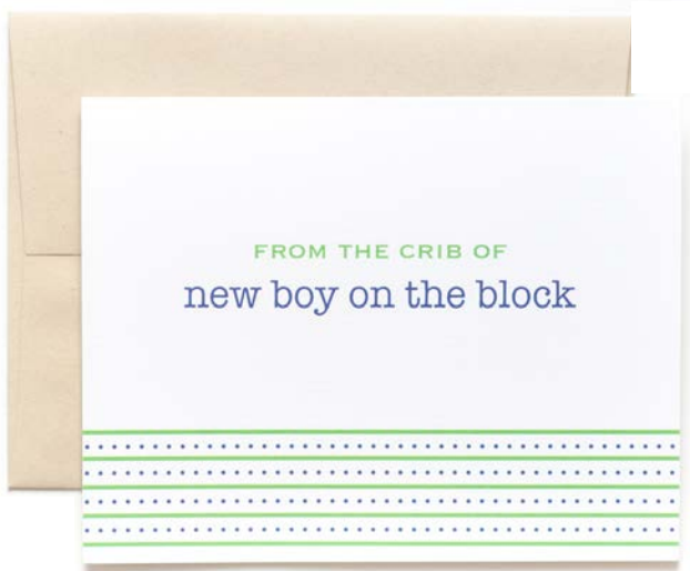
BOY01 from the crib of new boy on the block 4.25 x 5.5 folded card