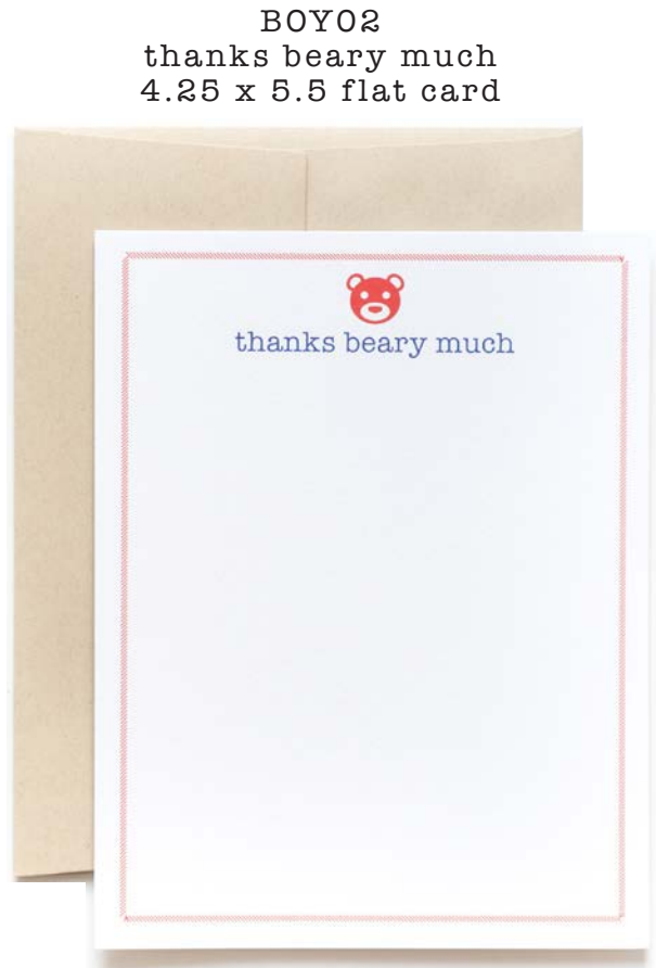
BOY02 thanks beary much 4.25 x 5.5 flat card