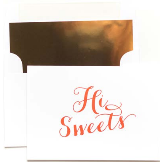
CAR02 hi sweets