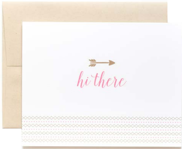
GIRLO3 hi there 4.25 x 5.5 folded card

set of 6 cards // see corresponding sizing paper bag envelopes (unlined) // minimum of 6 per style