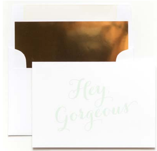
CAR05 hey, gorgeous