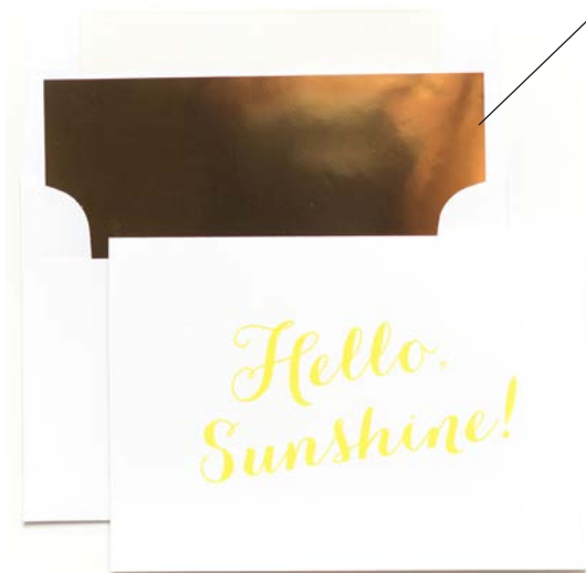
CAR03 hello, sunshine