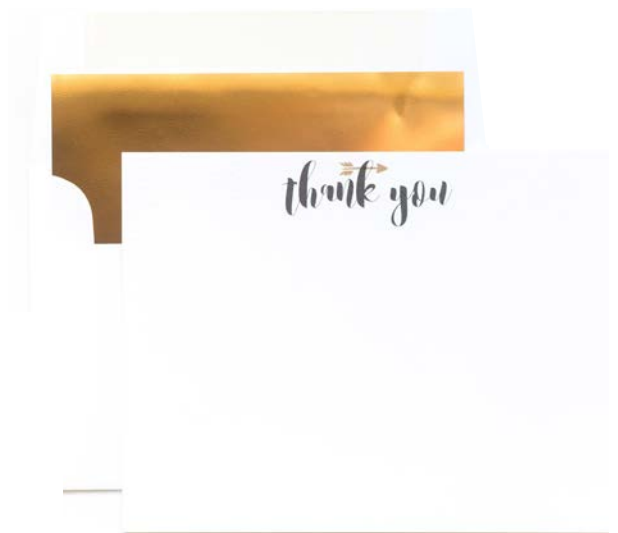
TYP08 thank you w/ arrow

single cards // 4.25 x 5.5 flat cards gold mirror-lined white envelopes // minimum of 6 per style // ask about custom sets