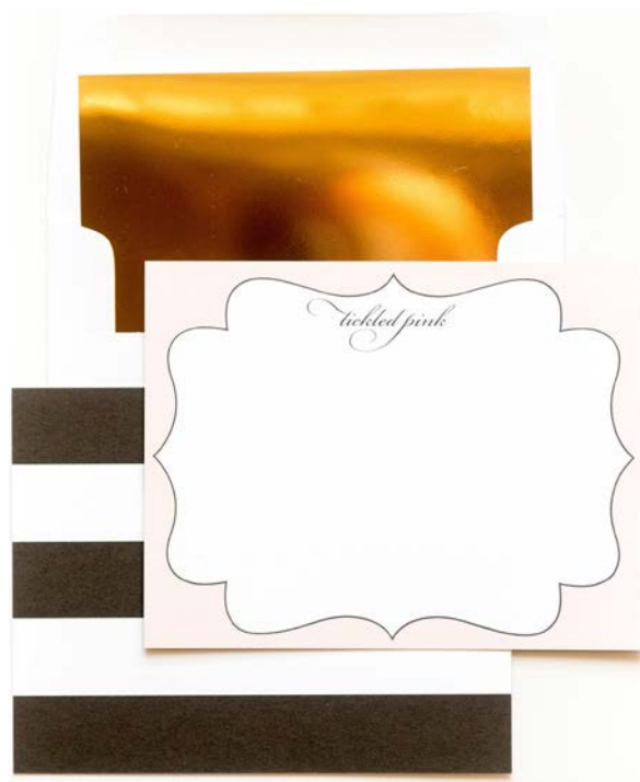
BRA06 tickled pink