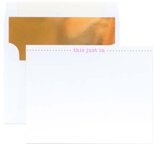
TYP04 this just in

single cards // 4.25 x 5.5 flat cards gold mirror-lined white envelopes // minimum of 6 per style // ask about custom sets