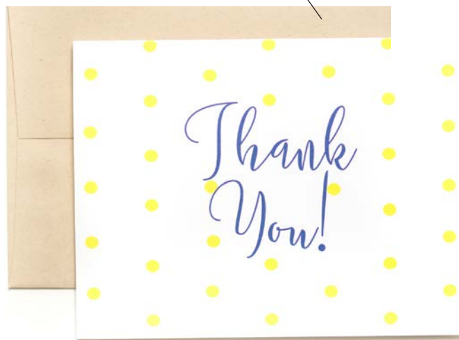
DOT03 thank you!

single cards // 4.25 x 5.5 folded cards paper bag envelopes (unlined) // minimum of 6 per style // ask about custom sets