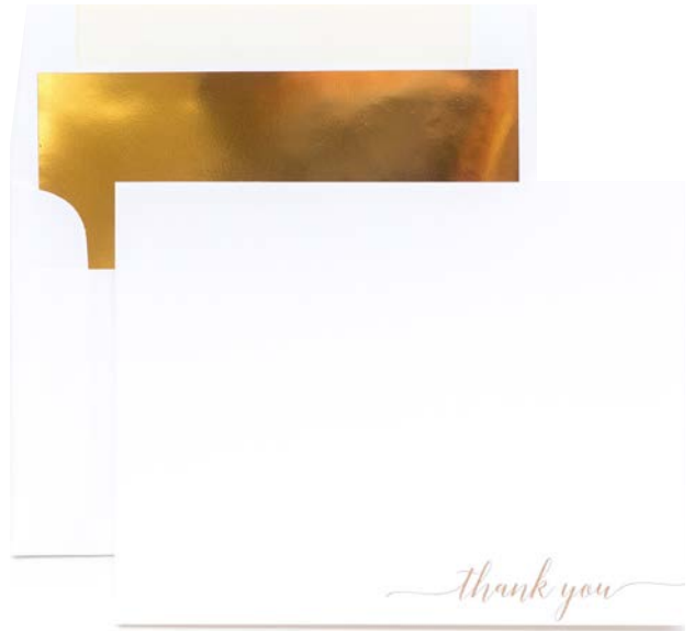
TYP02 thank you