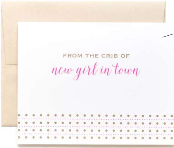
GIRLO1 from the crib of new girl in town 4.25 x 5.5 folded card

our top-selling personalized gift [ask about custom options]