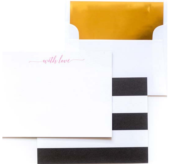
TYP06 with love // black cabana stripe back