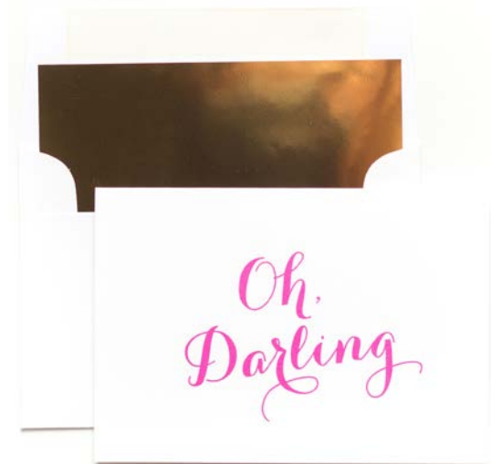
CAR04 oh, darling

set of 5 or single cards // 3.5 x 5 folded cards gold mirror-lined white envelopes // minimum of 6 per style or set