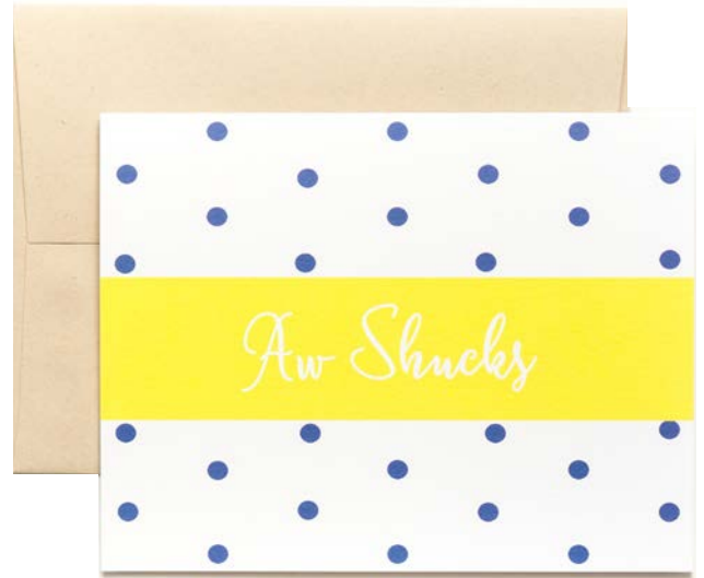
DOT02 aw shucks